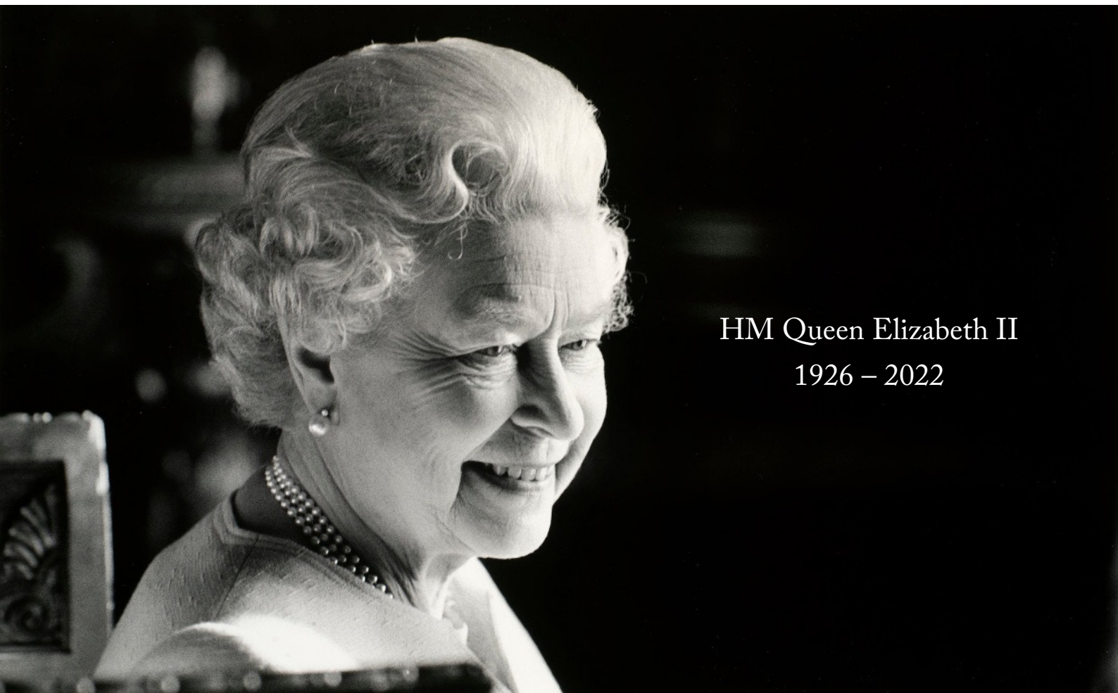
HM Queen Elizabeth II 1926 – 2022